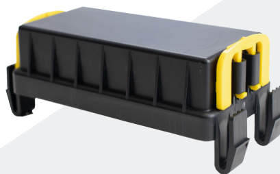
Cover Position Assurance