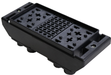
Maxi Combo x 280 x Maxi Combo