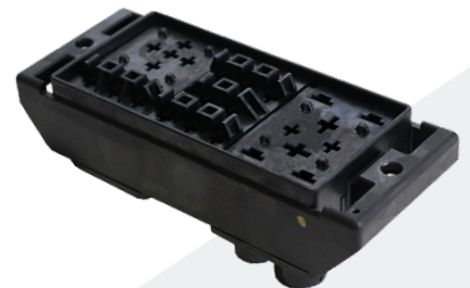
ISO Relay x ATO x Maxi Combo