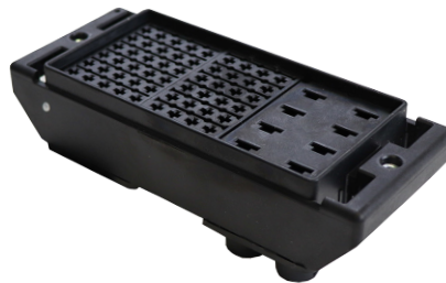
280 x 280 x Maxi Fuse