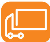
Medium & Heavy-Duty Trucks