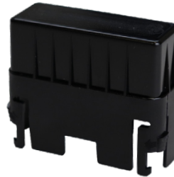
Low Height Cover