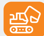
Construction & Forestry