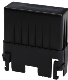
Standard Height Cover