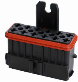
Standard Arm, Breather & Rotated Cavity 6 & 12