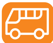
RVs & Bus