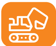
Construction & Forestry